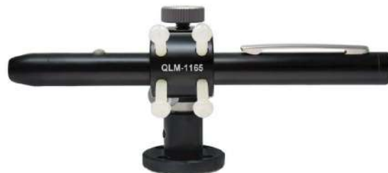
Laser pointer with QLM-1165