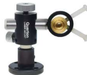
Ø16 with QLM-1165