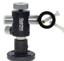
Ø4 with QLM-1125