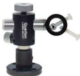
Ø6.5 with QLM-1125