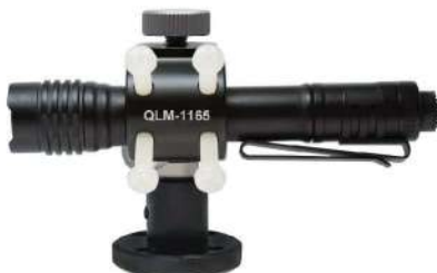
Flashlight with QLM-1165