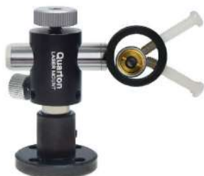
Ø12.5 with QLM-1165