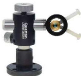
Ø10.5 with QLM-1125