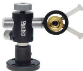
Ø16 with QLM-1165